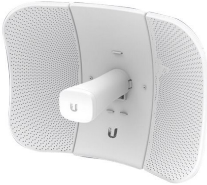
Ubiquiti LiteBeam ac gen2 23 dBi gain (recommended!)