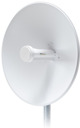
Ubiquiti PowerBeam AC 500 25 dBi gain