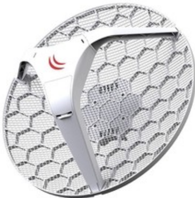
Mikrotik RBLHGG-5acD 24.5 dBi gain